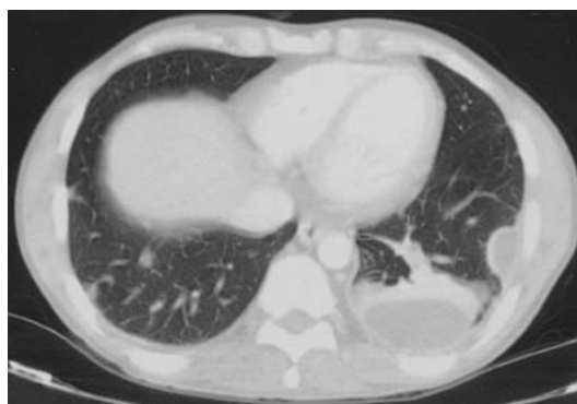
Fig. 4. Thoracic CT.